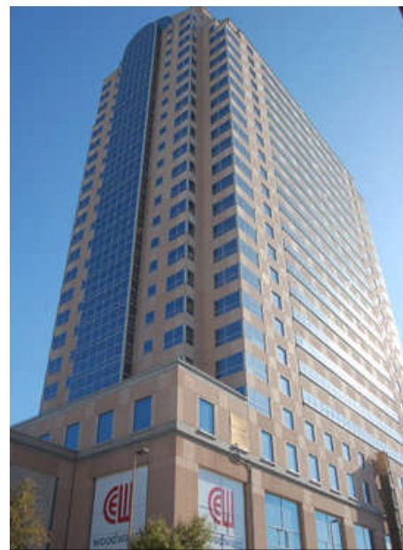
Picture of Benson Tower